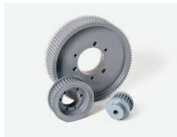
HTD Timing Pulleys