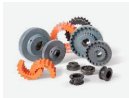
MD Flex Couplings