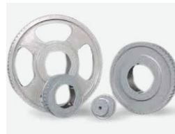
L & H Timing Pulleys